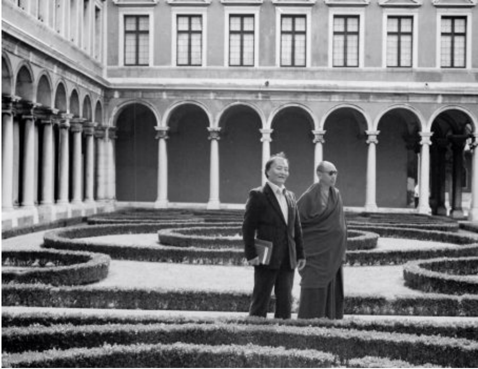
Chögyal Namkhai Norbu and Trogawa Rinpoche at the Cloister of the Cini Foundation during the 1st International Conference on Tibetan Medicine 1983.