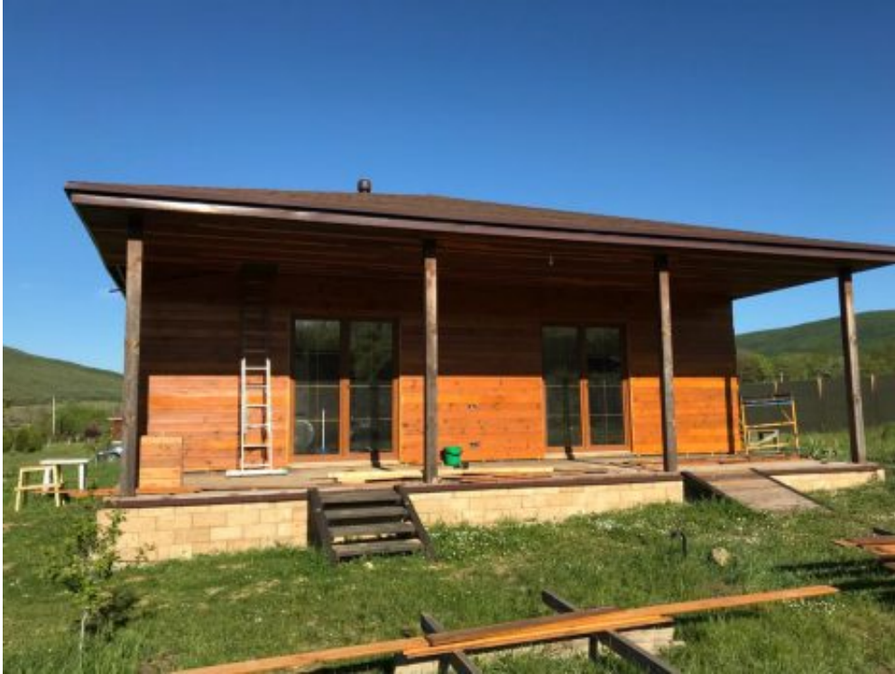
We are continuing to repair our guest-house with our own forces. Half of the house has already been repaired and it looks very beautiful and high-quality.