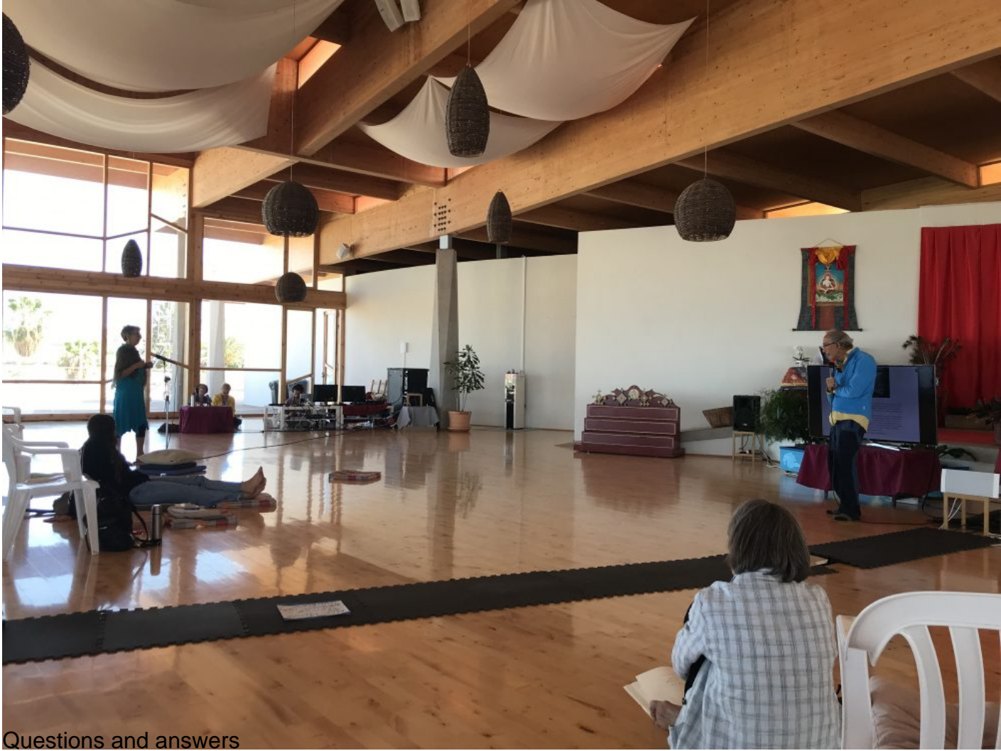
Questions and answers