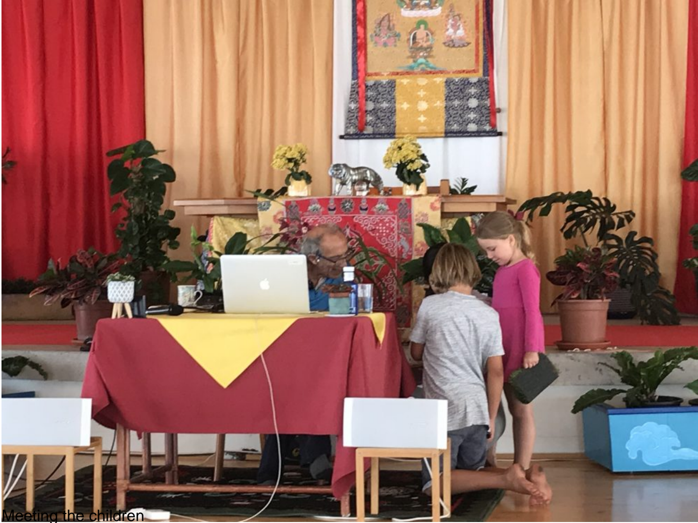
Meeting the children